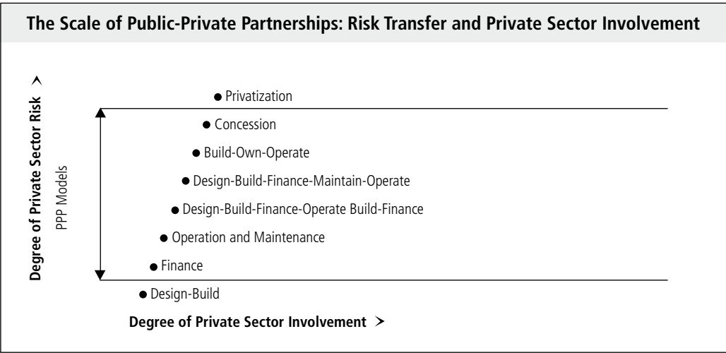
FIGURE 3: The Public-Private Spectrum and Model Definitions

While it is commonly cited that a ‘true’ form of PPP is a collaborative model where both the private and public sectors agree to share the risks and rewards of a particular project, there are a variety of approaches that illustrate the possible power-sharing and decision-making arrangements. A partnership with the private sector can fall under a consultative approach whereby the government seeks out expert advice from the private sector or community groups. There are also contributory arrangements which are identified as ones where the public sector provides funding to the private partner that is in turn responsible for carrying out the development and management of the