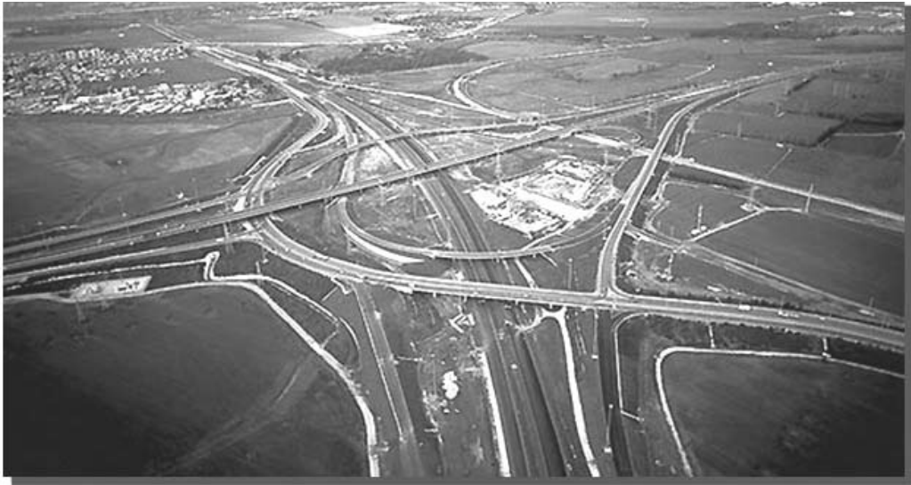
FIGURE 7: A View of Highway 6 in Israel