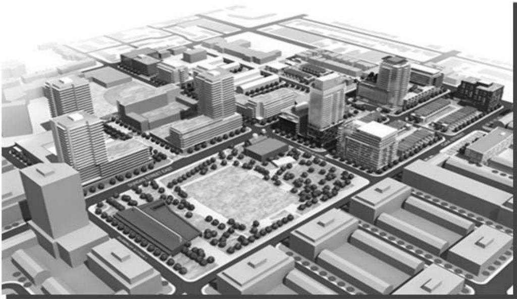
FIGURE 6: A Model of the Refurbished Regent Park Development Project

Once the scope of the project was clearly outlined and the majority of decisions about the vision of Regent Park were solidified, TCHC invited a number of private developers to a transparent and competitive procurement process to help with the design, financing, and construction of the project. Daniels was carefully selected for the first phase and a formal contract agreement was signed, clearly articulating the financial and legal responsibilities of each partner. The process was diligently managed by TCHC who even embedded control mechanisms into the agreement to ensure that the private developer fulfills its contractual obligations. It was understood that, if Daniels did not satisfy its project requirements during the first phase, the developer would not be invited back to