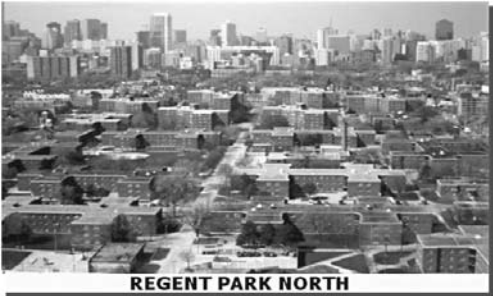
FIGURE 5: Perspective View of Regent Park North Prior to Project Development