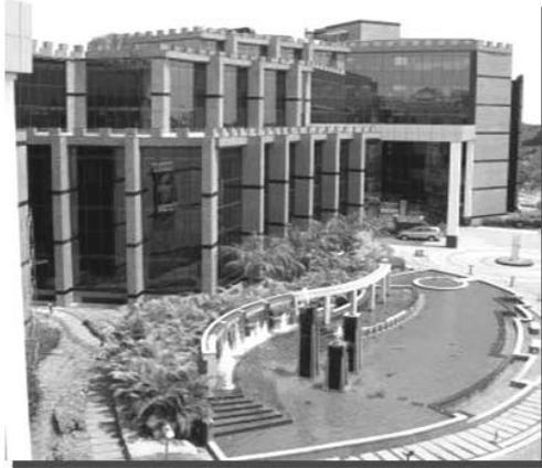
FIGURE 9: Manipal University Medical College in Manipal, India