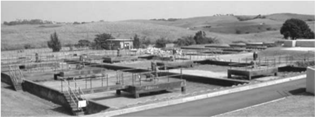
FIGURE 8: Ilembe District Community Water and Wastewater Plant